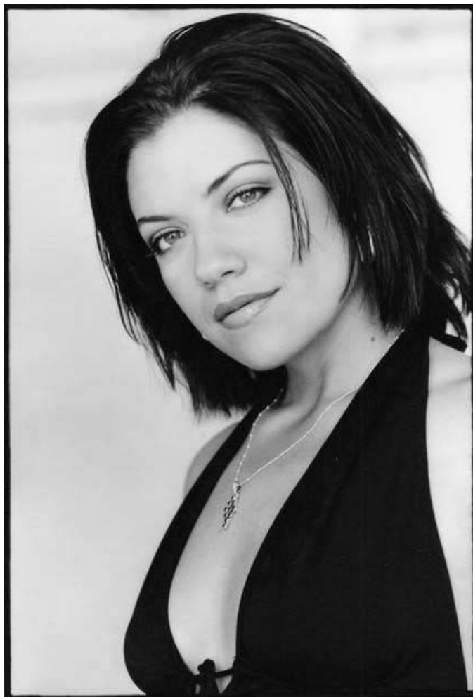
Bonne & Clyde vs. Dracula (2008) – “When gangsters meet vampires there’s bloody hell to pay.”

► Tiffany Shepis – An east coast native, she starred in numerous music videos before heading to LA.